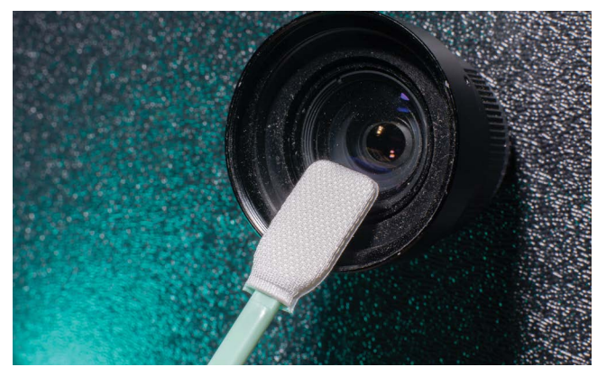
TX714MD Microdenier Large Swab